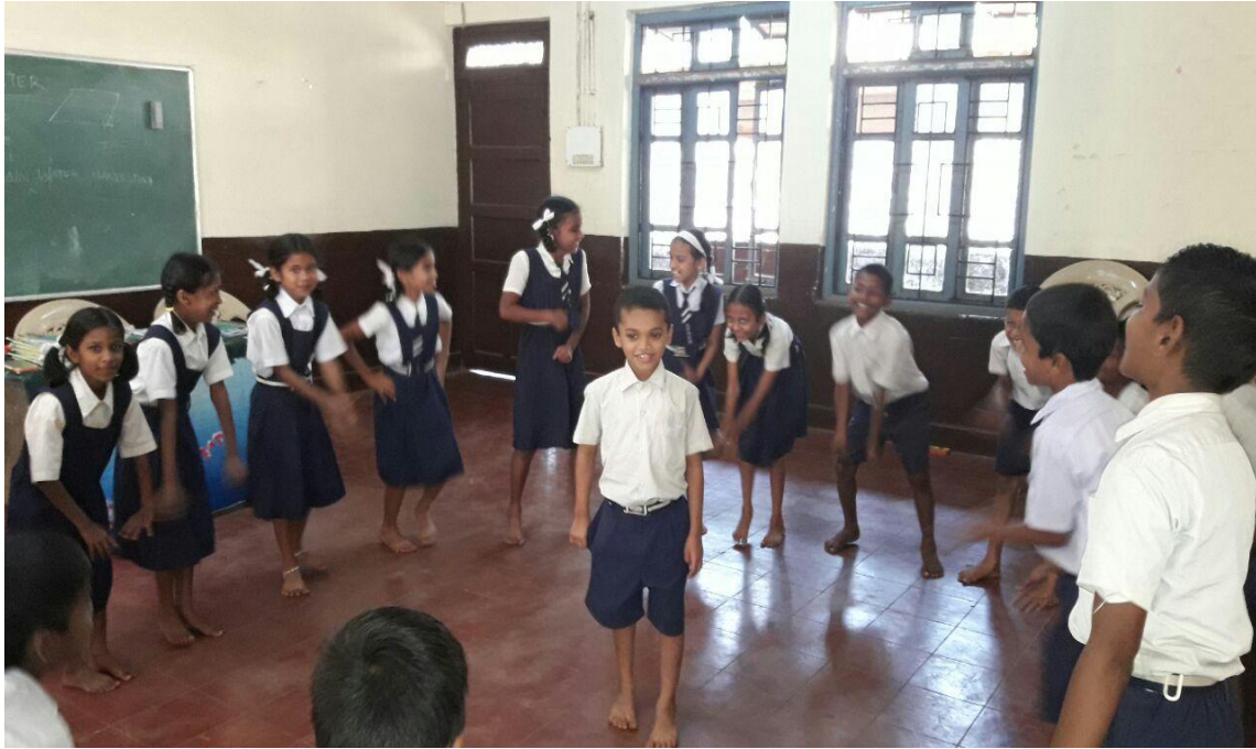
Picture 3: Children enjoying the Cooperative Games under Mulyavardhan Program