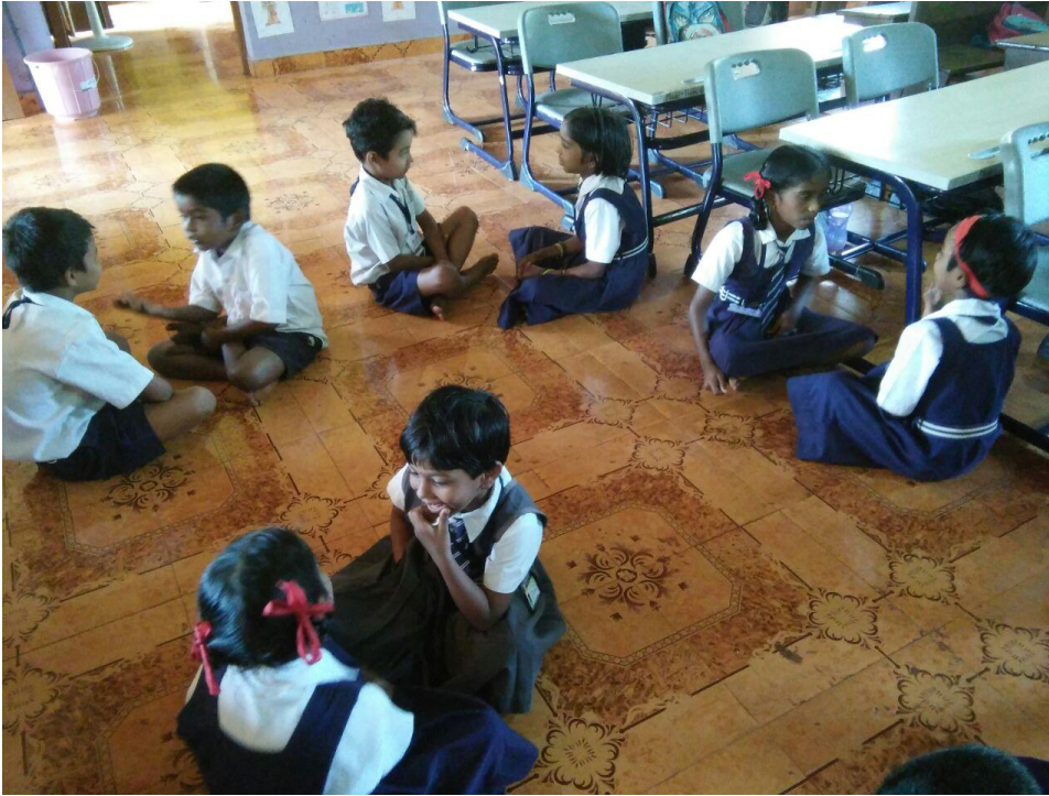
Picture 1: Children engaged in pair to discuss Mulyavardhan activity