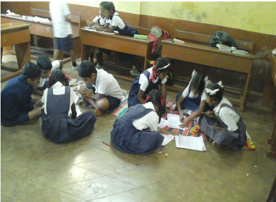
Picture 2: Children engaged in groups to discuss the Mulyavardhan Activity