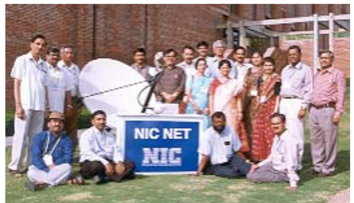
NIC Team with the VSAT set up outside the venue of ELITEX-2002