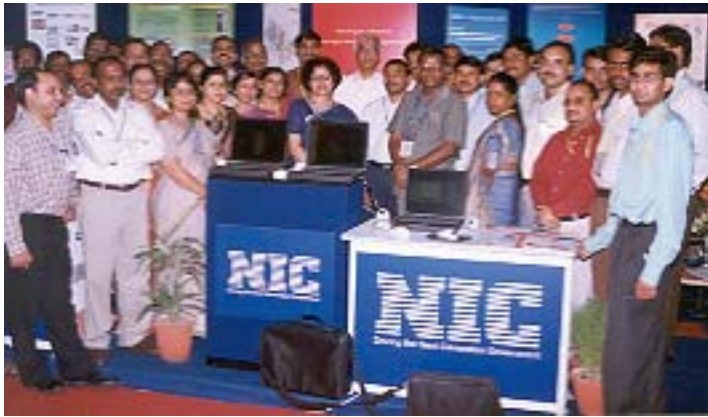
The proud team of NICians who participated in ELITEX-2002