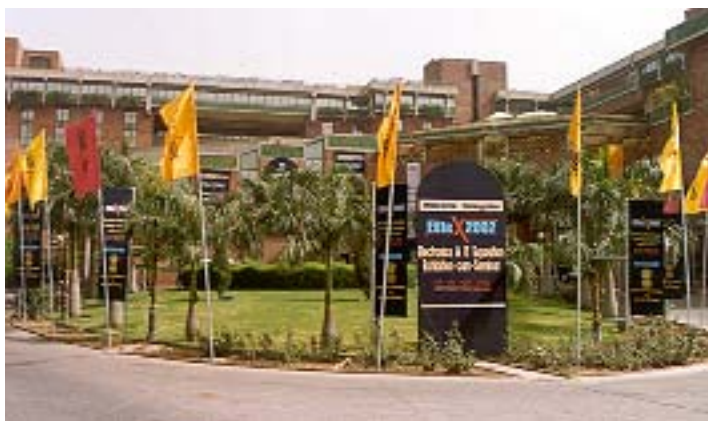
India Habitat Centre the venue for Elitex-2002