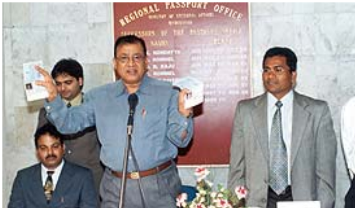
Director General Police, Hyderabad releasing the computerprinted passports at RPO hyderabad

:: Decentralization of the functions of receipt and scrutiny of passport applications to the district level :- The distribution and sale of passport application forms has already been decentralized.