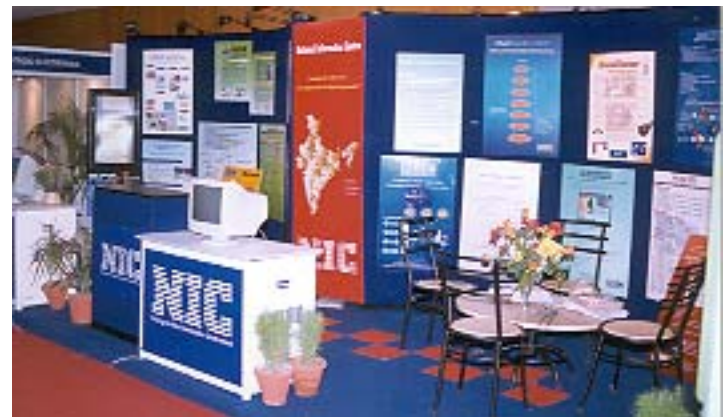
The colourful display at NIC stall during the exhibition at ELITEX-2002

"A great pleasure to see the way NIC has developed: from the vision of a quarter of century ago to wideranging applications of great social significance, giving us hope that technology can play an important role in leap frogging into the future. Keep it up. All the Best...."